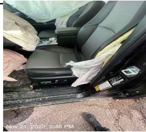
Alternate Picture 2